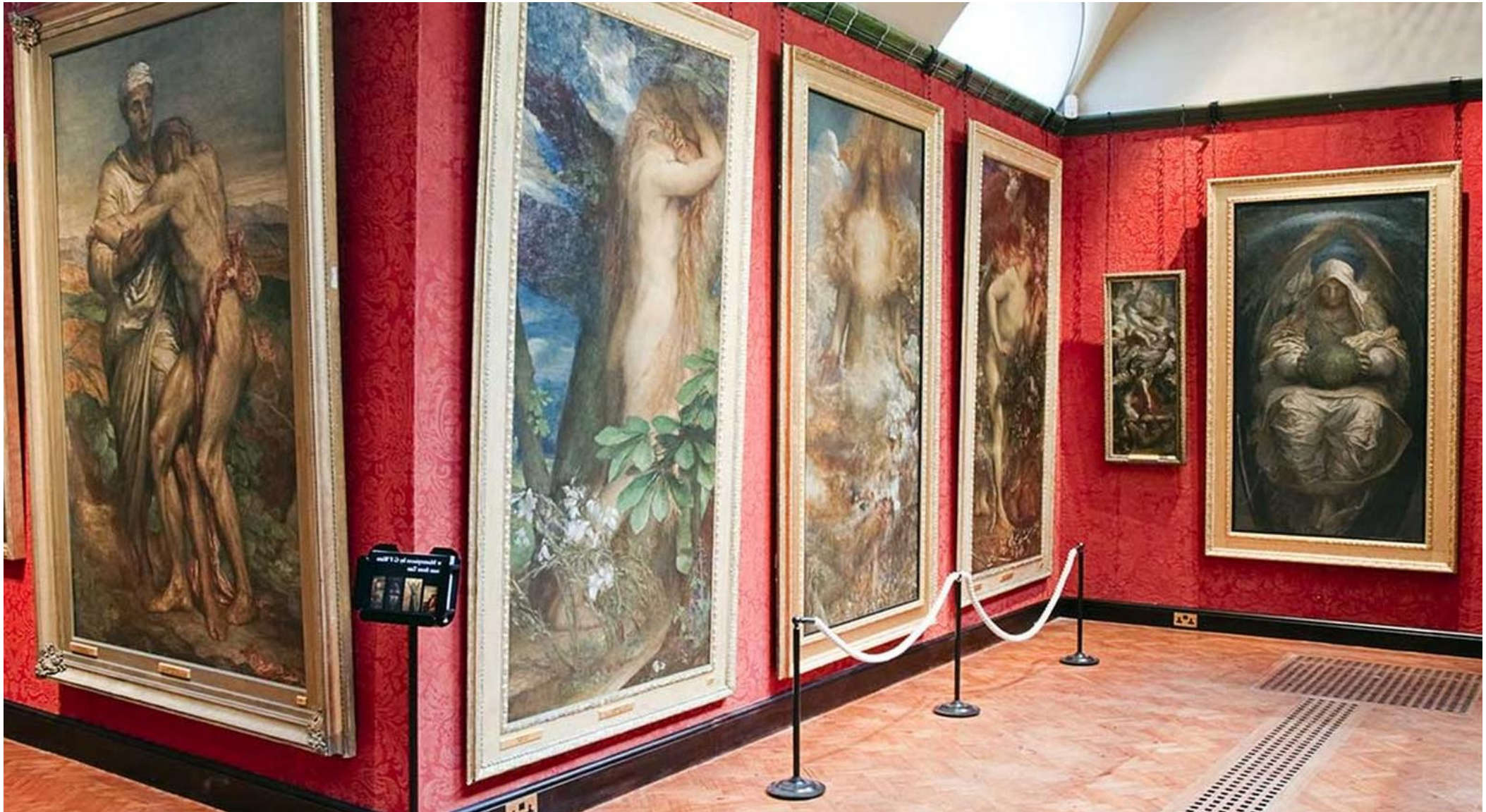
A corner of Watts Gallery